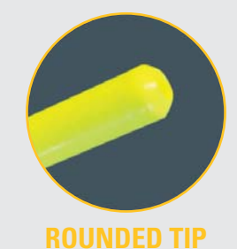
to maximise calf comfort