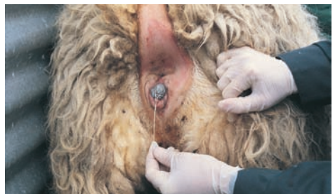
Day 14 Withdraw Chronogest sponge