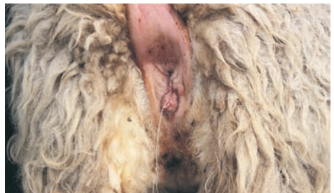
Day 0 Sponge in position - note that strings are easily seen