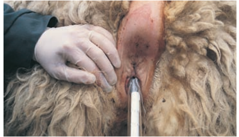
Day 0 Gently insert Chronogest sponge with applicator

Sponges should be removed after the required time by gently pulling on the strings. As each sponge is removed, it may be accompanied by a small amount of distinctive-smelling fluid. This in no way affects either the ewe's health or her subsequent reproductive performance. It is important that used sponges are disposed of safely, since they are attractive to some dogs and can cause problems if swallowed. If no strings are evident, carefully examine the vagina. If the sponge is still in position, ensure that it is removed.