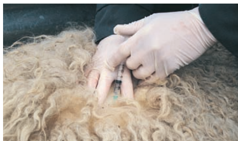
Inject PMSG-Intervet intra-muscularly as required at sponge removal

Oestrus usually occurs 36 to 72 hours after sponge withdrawal, but occasionally may be evident as early as 24 hours after removal. However, rams must not be introduced earlier than 48 hours following sponge removal. Otherwise they will repeatedly serve the same ewes, depleting their semen reserves prior to the main group coming into season.